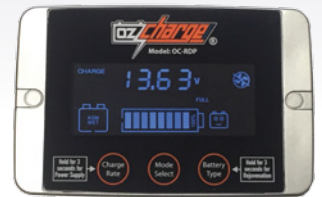
Optional wired remote display: Model: OC-RDP